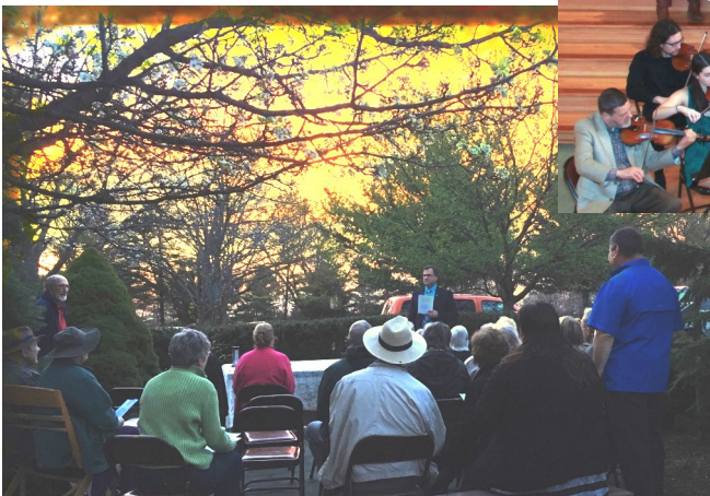
Sunrise Service, Bethlehem cemetery