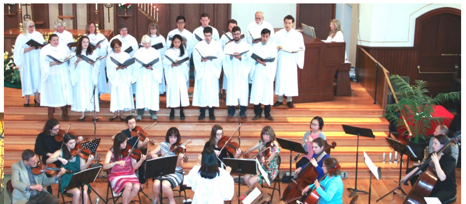
Easter Sunday music