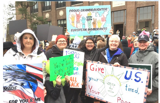
The Immigrants' March in Ann Arbor, March 25.