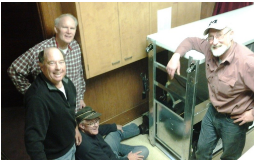
New sacristy cooler. Thanks guys!