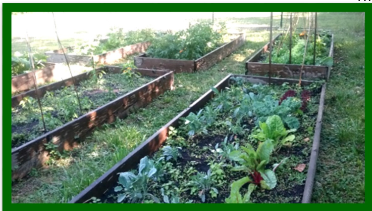
Our Faith and Food Garden is growing well. Thank you Bethlehem gardeners!