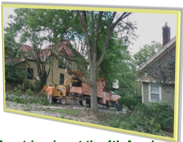
Tree trimming at the 4th Ave. house