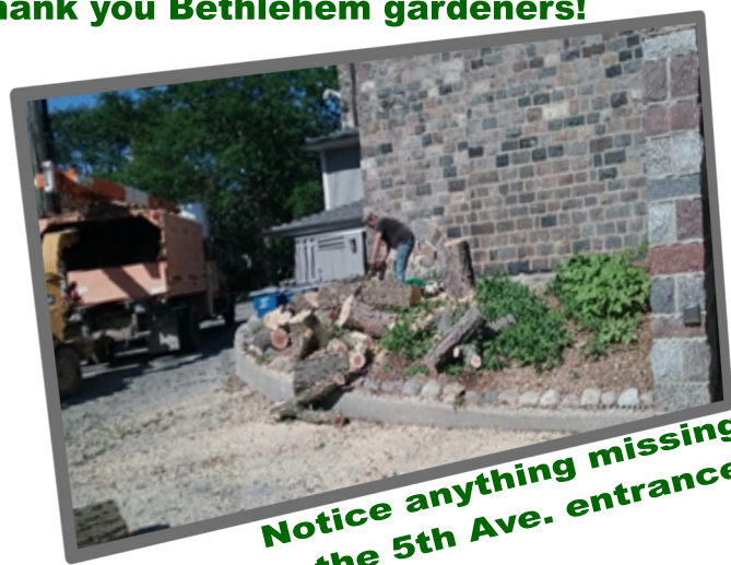
Notice anything missing by the 5th Ave. entrance?