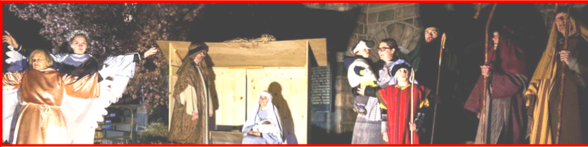
Living Nativity, presented at Bethlehem Church by Bethlehem members and friends, December 1, 2017