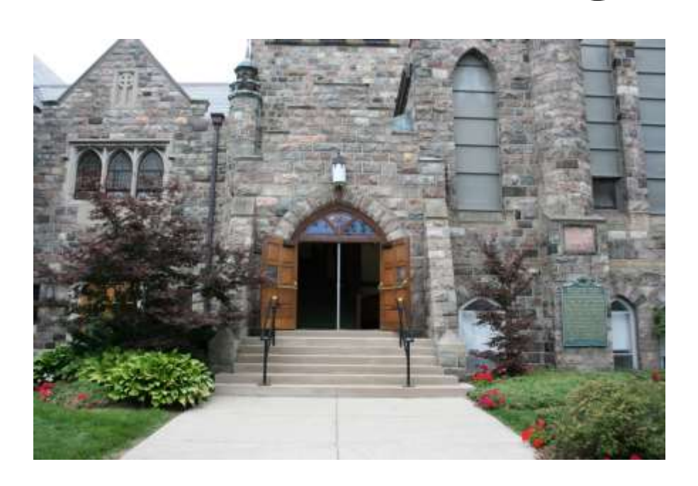
Bethlehem United Church of Christ Bylaws