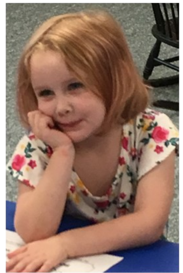
Combining classrooms for the summer