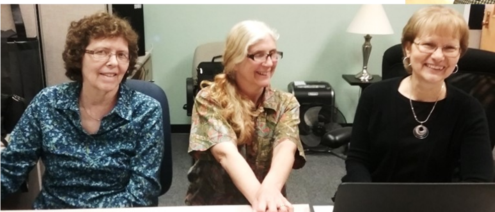
Staff and Office Volunteers working side by side - TEAM WORK!