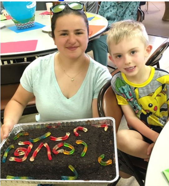
CAKE AUCTION FUN