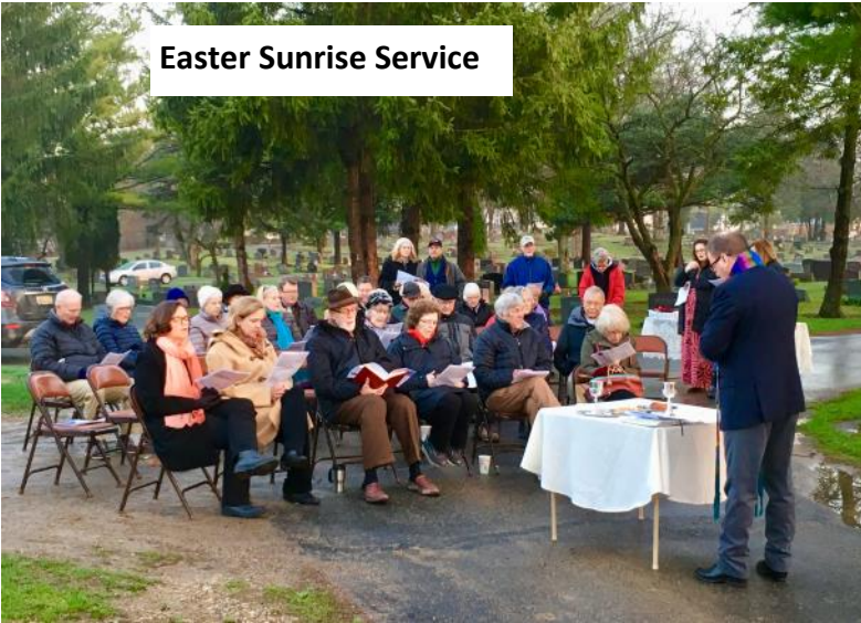
Easter Sunrise Service