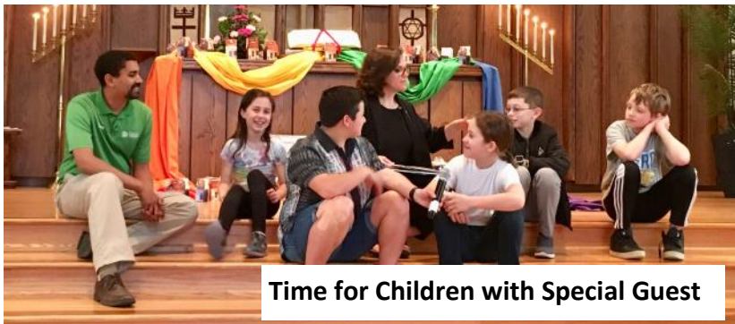
Time for Children with Special Guest