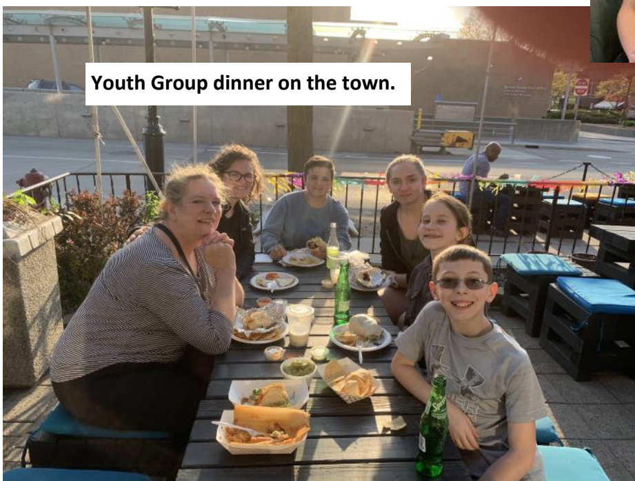
Youth Group dinner on the town.