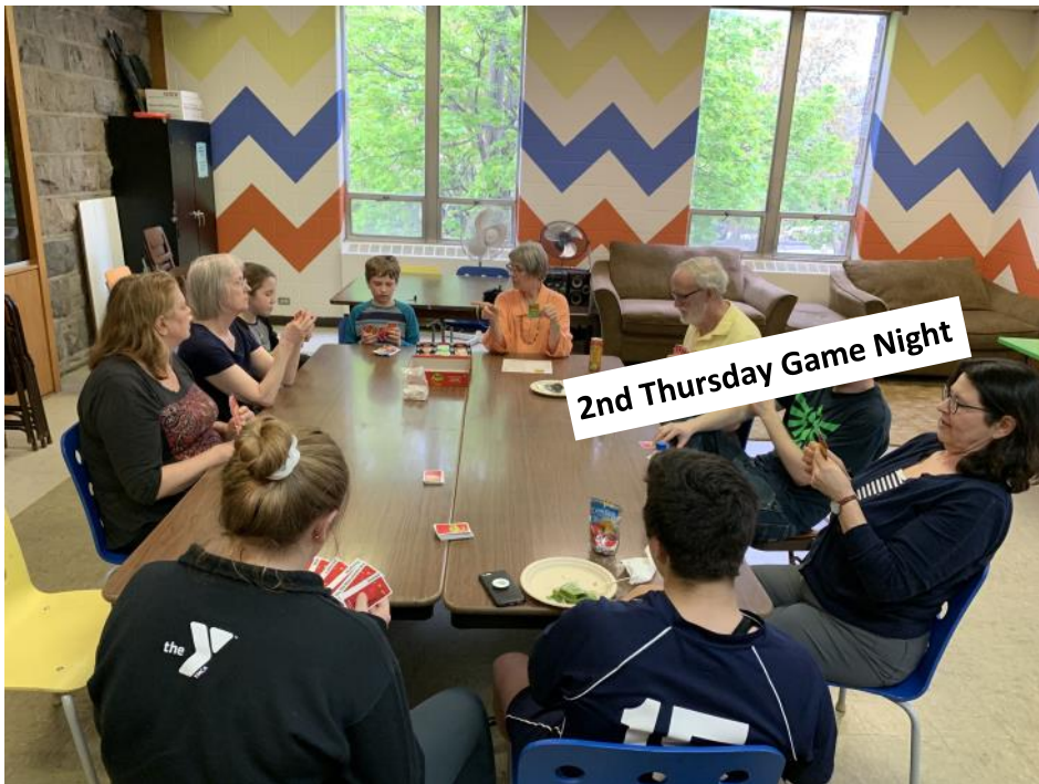
2nd Thursday Game Night