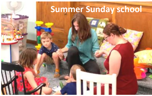
Summer Sunday school