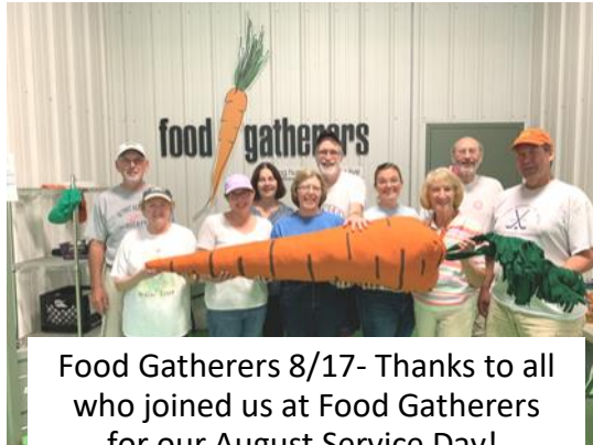
Food Gatherers 8/17- Thanks to all who joined us at Food Gatherers for our August Service Day!