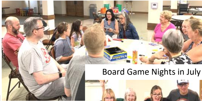
Board Game Nights in July and August