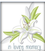
Jerry Steeb 1/19/1949 - 9/26/2020