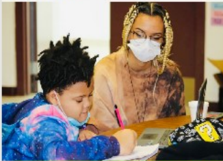
Houses2Home helps many families, from Alpha House, transition into their own homes.

If you want to help build bright futures for Peace youth, families, and adults every time you go grocery shopping, head to this Peace webpage for detailed instructions on how to sign up: https://peaceneighborhoodcenter.org/grocery-rewards/ .