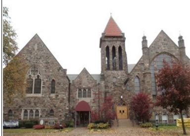
Present Day Church

The afternoon begins with building tours from 3:00-4:30 pm where you will be able to visit our awe-inspiring sanctuary and hear a brief presentation of its history and view the incredible stained glass windows. Tour leaders will guide you throughout the building to learn about the diverse community programs we support at Bethlehem.