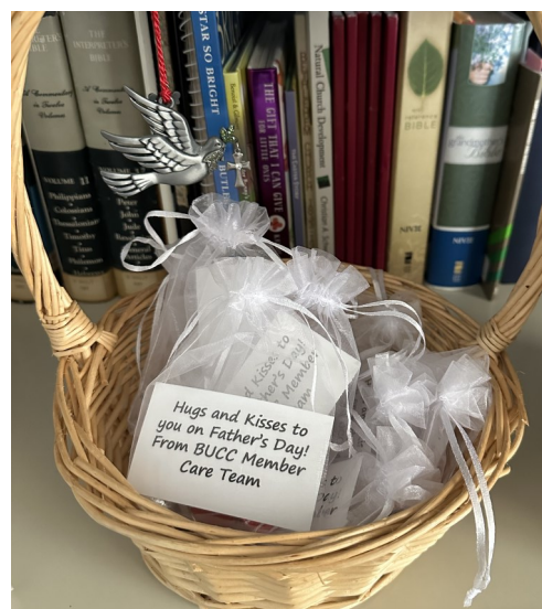
Father's day treats from the June 16th Service